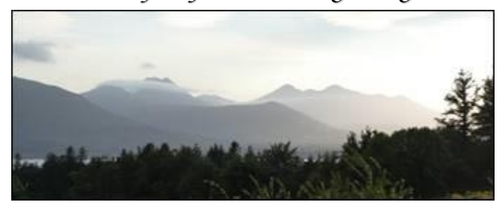
Evening view of Kerry mountains from Killarney viewpoint