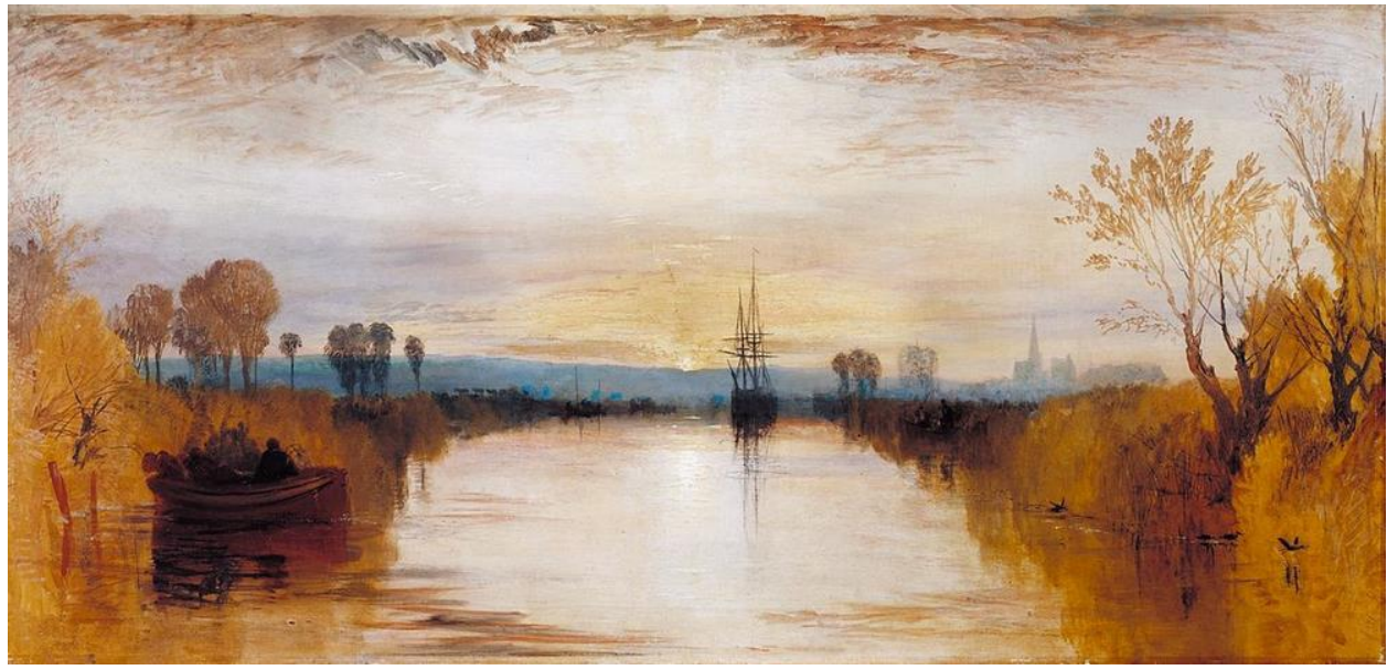
The Chichester Canal by JMW Turner c1829 [Thanks to David Abbott for bringing this to my attention]

The <u>Portsmouth & Arundel Canal</u> was opened in 1822. It ran from Salterns Lock to Ford. This was part of a secure inland route from London to the headquarters of the Royal Navy at Portsmouth. The first 2.5 miles (Salterns Lock to Hunston) was built to a wider gauge & allowed ships to reach Chichester via a 1.5 mile extension north (the Ship Canal). The canal from Hunston to Ford was abandoned in 1855; Salterns Lock to Chichester followed suit in 1928 but the <u>Chichester Ship Canal Trust</u> have been working on restoration since 1984.