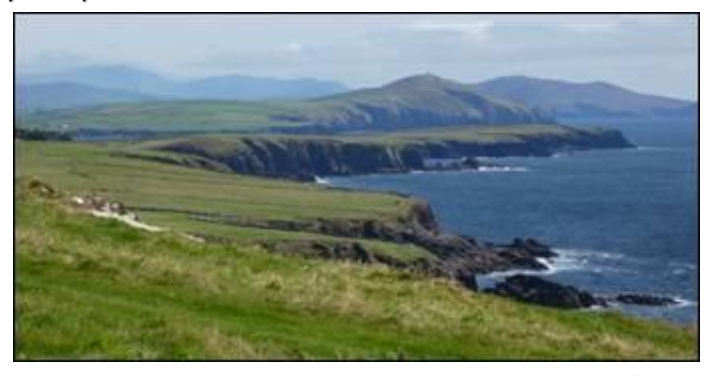
View over Dingle Bay

Other Events / Items . . . None this time